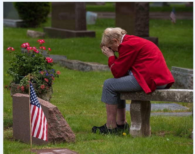
A woman is pictured in a file photo near the graves of her husband and son at Allouez Catholic Cemetery in Allouez, Wis. Because COVID-19 pandemic response measures restrict most gatherings, the Vatican has extended the usual plenary indulgence to souls in purgatory from just the first week in November to include the entire month.

The Catechism of the Catholic Church says, "All who die in God's grace and friendship, but still imperfectly purified, are indeed assured of their eternal salvation; but after death they undergo purification so as to achieve the holiness necessary to enter the joy of heaven."