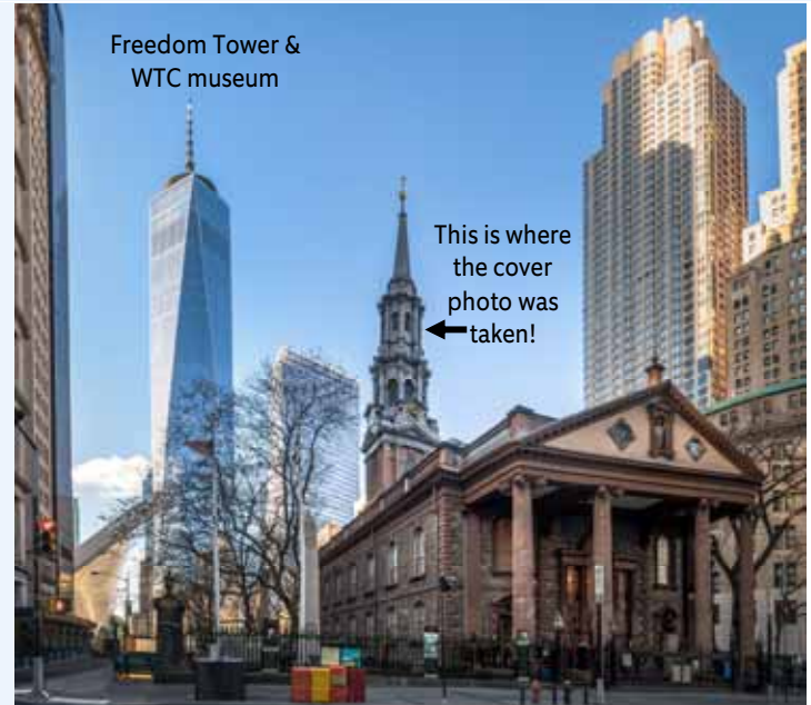
The new Freedom Tower is directly behind St. Paul's Chapel.

After the inaugural address at the Federal Hall, all the members of the House and Senate, led by America's first president, traveled on foot to St. Paul's Chapel. While there are no records of what was said inside, we do know the entire congregation was on their knees praying for 2 hours and consecrating this nation to God. A plaque above Washington's pew reads: "Almighty God, we make our earnest prayer that you will keep the United States in Holy protection."