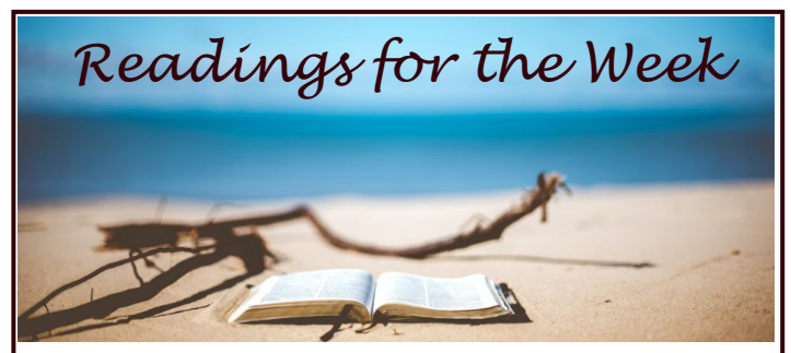
July 16, 2023

Please call Sue Nolan at 718-637-1162 for more information. All are welcome!