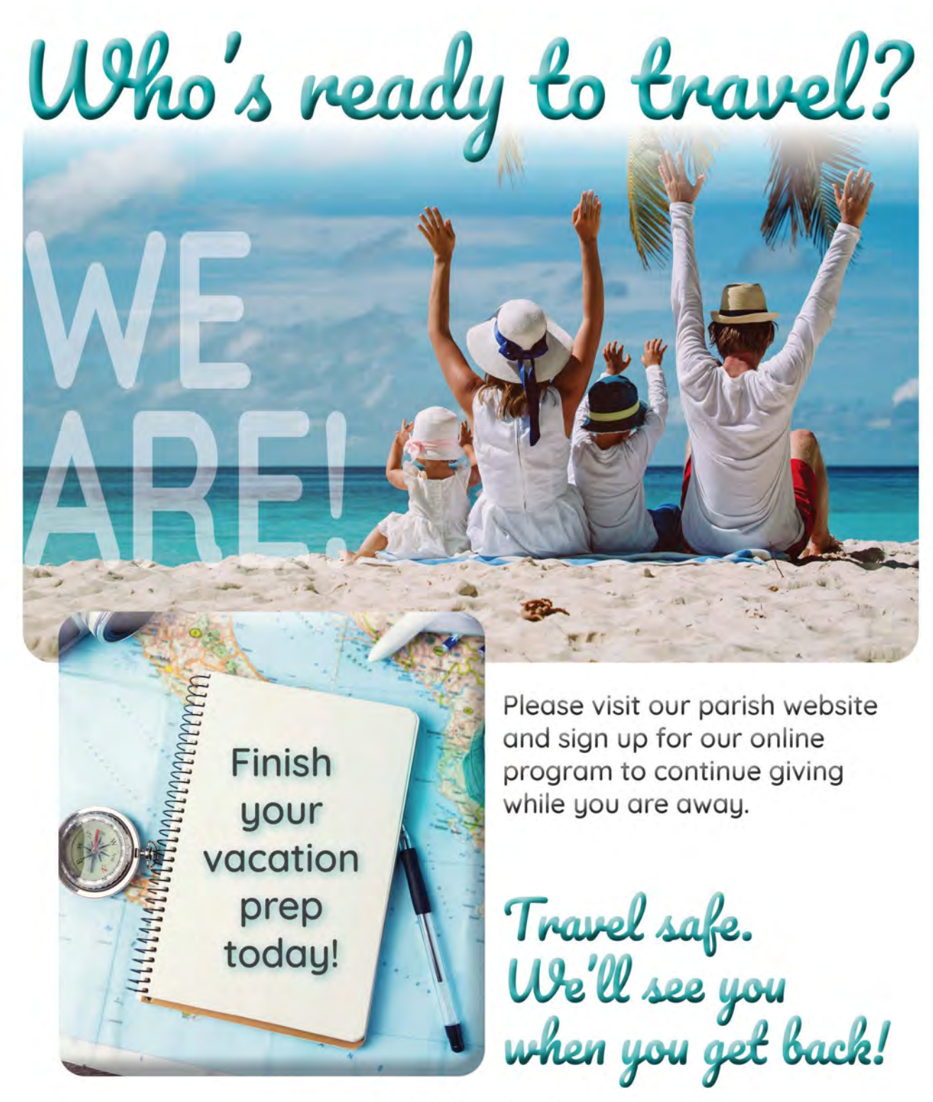
St. Mark's Church