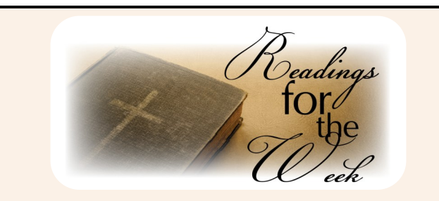
May 18, 2025

May 26: The Rectory Office will be closed in observance of Memorial Day, and will reopen on Tuesday, May 27 at 9AM.