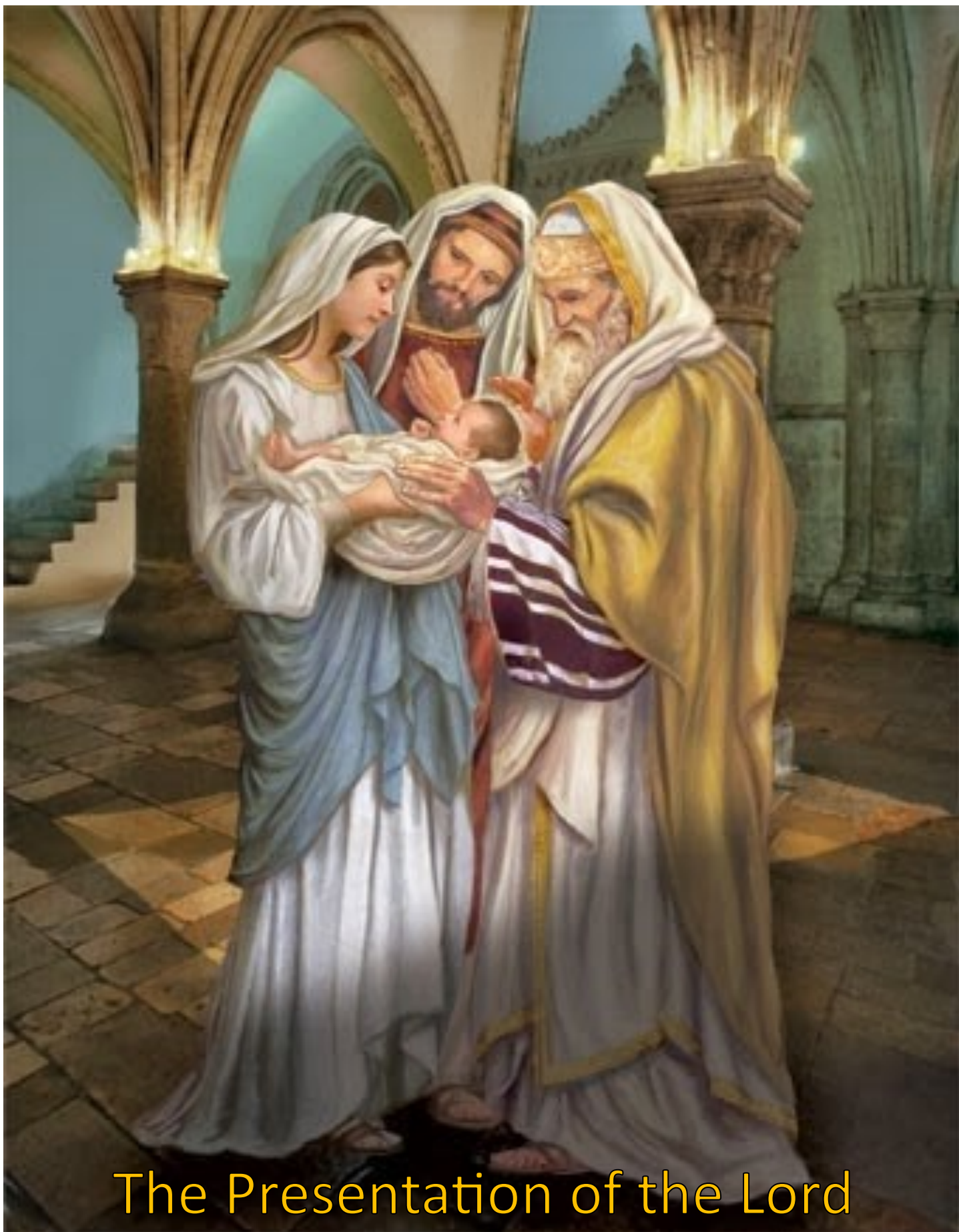
The Presentation of the Lord