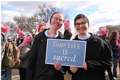
Sisters of Life at this year’s March for Life.