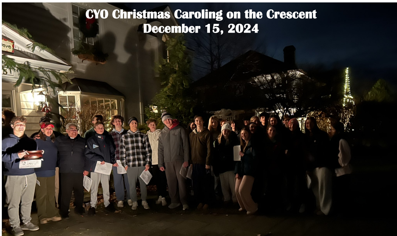
CYO Christmas Caroling on the Crescent December 15, 2024

An old year fades away... a new year about to begin. In the last play we read in 2024, we saw five faithful friends join together to celebrate not only their friendship but the eternal bond they feel with all who look into the night sky, see a shining star, and follow it. They are people of faith, hope, love and joy. The miracles of Christmas are in our very souls. We know we were created by a loving God Who is gently guiding us home. He is a tough taskmaster but loves us like no other. He calls us to achieve our part in building the kingdom of God on earth in ways we cannot begin to imagine. All things for His glory and for our fellow travelers on the way to His eternal kingdom!!! Our CYO felt the best gift to give Him was to go to Him each day—in thoughts, in speaking with Him through prayer, in service to Him and His people, in reading His word in the scriptures and just being there for others who will only know Him through us.