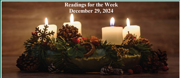
Readings for the Week December 29, 2024

Monday 1 Jn 2:12-17 Ps 96:7-8a, 8b-9, 10 Lk 2:36-40 Tuesday 1 Jn 2:18-21 Ps 96:1-2, 11-12, 13 Jn 1:1-18 Wednesday Nm 6:22-27 Ps 67:2-3, 5, 6, 8 Gal 4:4-7 Lk 2:16-21 Thursday 1 Jn 2:22-28 Ps 98:1, 2-3ab, 3cd-4 Jn 1:19-28 Friday 1 Jn 2:29-3:6 Ps 98:1, 3cd-4, 5-6 Jn 1:29-34 Saturday 1 Jn 3:7-10 Ps 98:1, 7-8, 9 Jn 1:35-42 Sunday Is 60:1-6 Ps 72:1-2, 7-8, 10-11, 12-13 Eph 3:2-3a, 5-6 Mt 2:1-12.