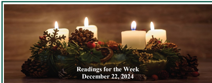
Readings for the Week December 22, 2024

Monday Mal 3:1-4, 23-24 Ps 25:4-5ab, 8-9, 10 and 14 Lk 1:57-66 Tuesday Morning 2 Sm 7:1-5, 8b-12, 14a, 16 Ps 89:2-3, 4-5, 27 and 29 Lk 1:67-79 Wednesday Vigil Is 62:1-5 Ps 89:4-5, 16-17, 27, 29 Acts 13:16-17, 22-25 Mt 1:1-25 or 1:18-25 Wednesday Night Is 9:1-6 Ps 96: 1-2, 2-3, 11-12, 13 Ti 2:11-14 Lk 2:1-14 Wednesday Dawn Is 62:11-12 Ps 97:1, 6, 11-12 Ti 3:4-7 Lk 2:15-20 Wednesday Day Is 52:7-10 Ps 98:1, 2-3, 3-4, 5-6 Heb 1:1-6 Jn 1:1-18 or 1:1-5, 9-14 Thursday Acts 6:8-10; 7:54-59 Ps 31:3cd-4, 6 and 8ab, 16bc and 17 Mt 10:17-22 Friday 1 Jn 1:1-4 Ps 97:1-2, 5-6, 11-12 Jn 20:1a, 2-8 Saturday 1 Jn 1:5-2:2 Ps 124:2-3, 4-5, 7cd-8 Mt 2:13-18 Sunday Sir 3:2-6, 12-14 or 1 Sm 1:20-22, 24-28 Ps 128:1-2, 3, 4-5 or Ps 84:2-3, 5-6, 9-10 Col 3:12-21 or 3:12-17 or 1 Jn 3:1-2, 21-24 Lk 2:41-52.