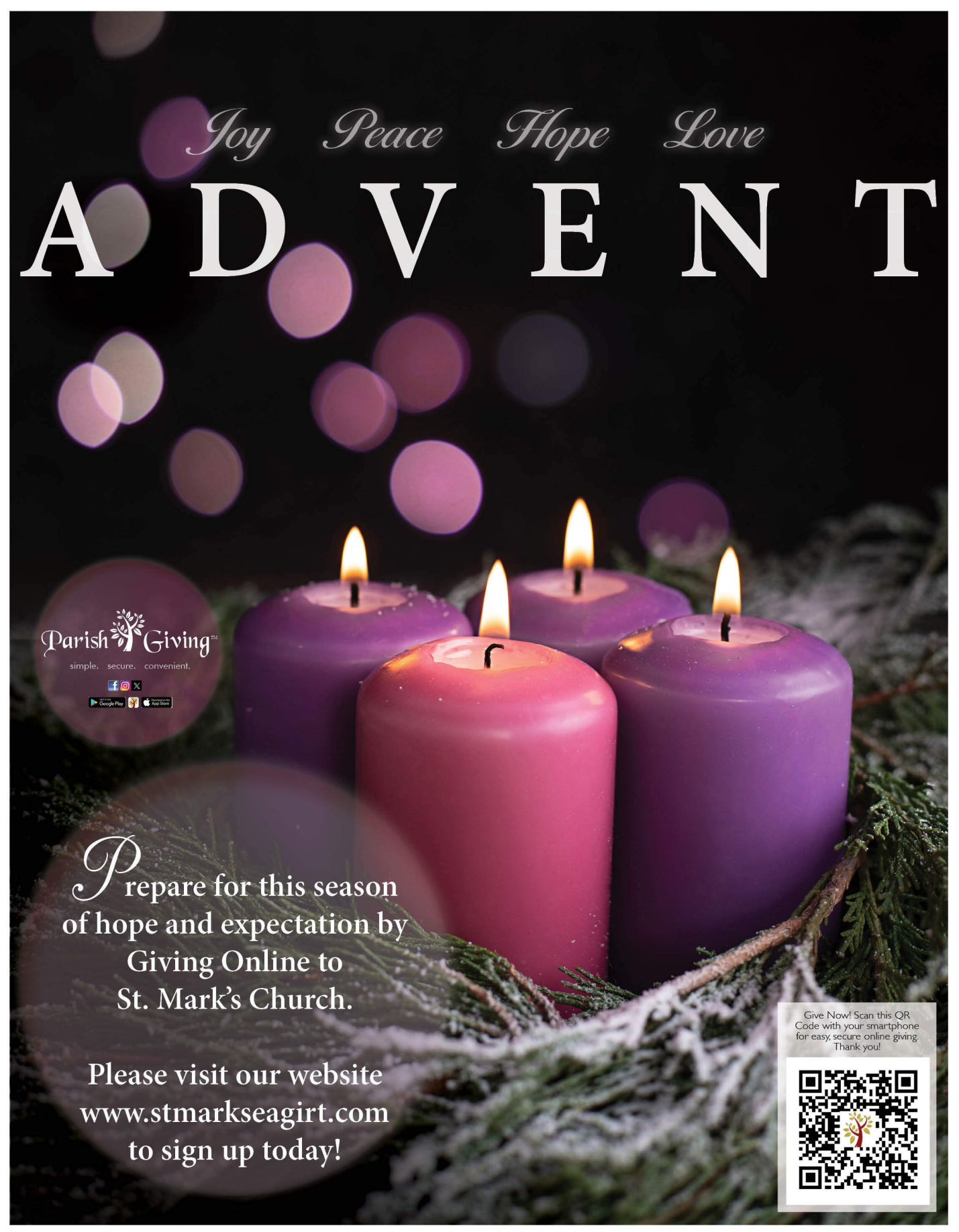
Parish Giving offers secure flexible Online Giving for our parishioners who would like to make their donations online using a credit card or bank transfer. You never have to bring cash or checks to church. Online Giving helps the church save money and plan the budget.