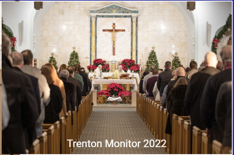
Trenton Monitor 2022