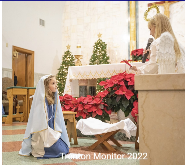
Trenton Monitor 2022