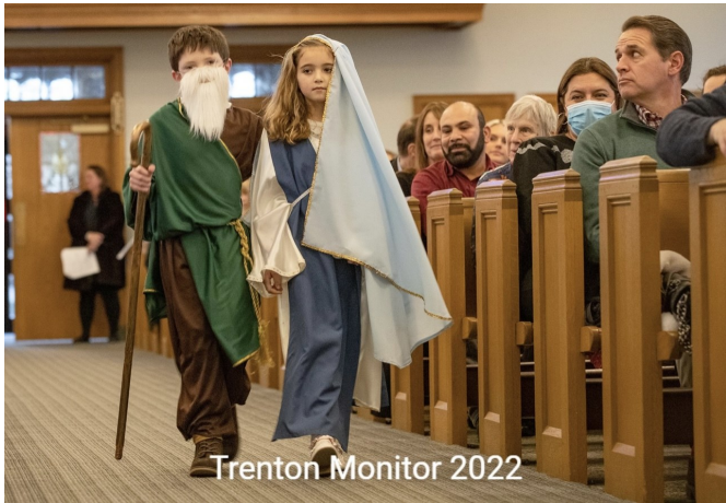
Trenton Monitor 2022