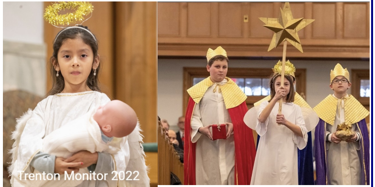
Trenton Monitor 2022