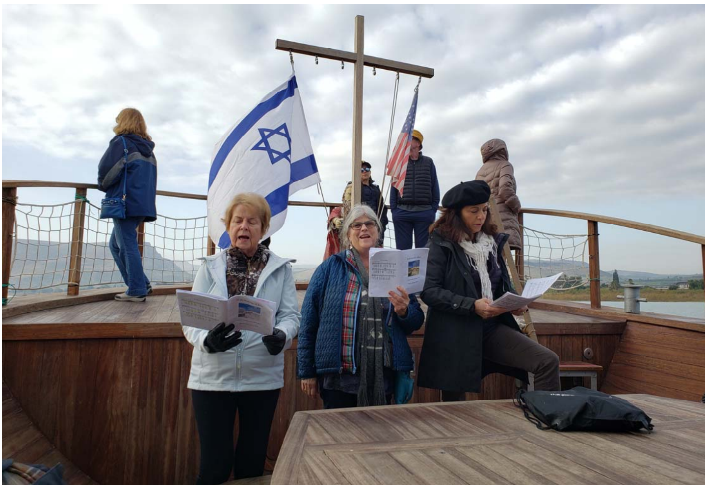
Photo from the Holy Land Pilgrimage Led by Monsignor Flynn: On the Sea of Galilee singing "Lord, you have come."